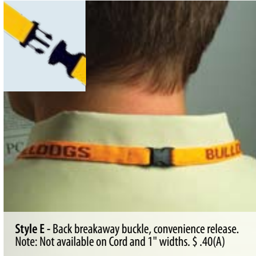
Style E - Back breakaway buckle, convenience release. Note: Not available on Cord and 1" widths. $.40(A)