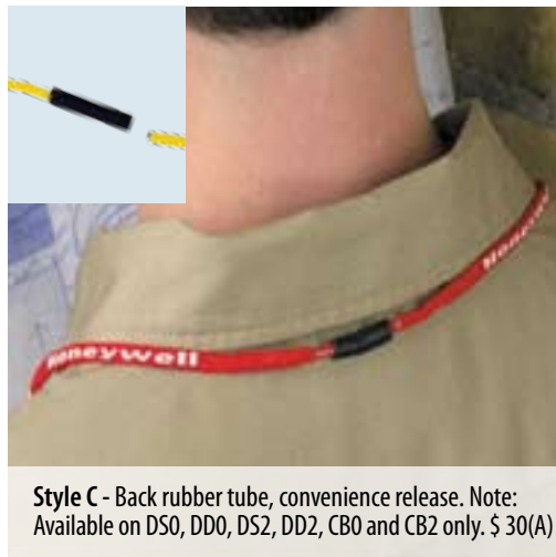
Style C - Back rubber tube, convenience release. Note: Available on DSO, DD0, DS2, DD2, CB0 and CB2 only. $.30(A)