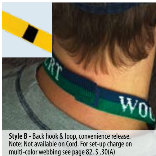
Style B - Back hook & loop, convenience release. Note: Not available on Cord. For set-up charge on multi-color webbing see page 82. $.30(A)