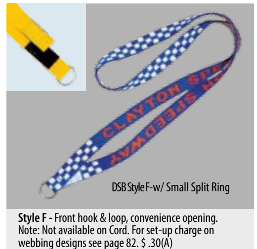
Style F - Front hook & loop, convenience opening. Note: Not available on Cord. For set-up charge on webbing designs see page 82. $.30(A)